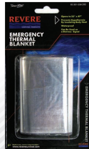
In carded package